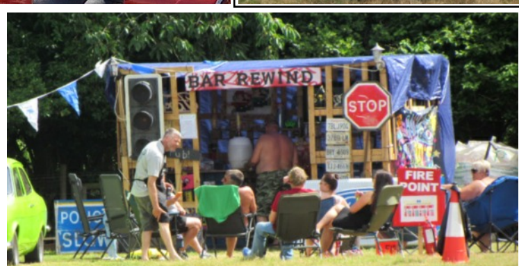
Fordsport won Best Themed Club Stand with their 'Bar Rewind' and a big screen 'Fast and Furious' film show on Friday night.